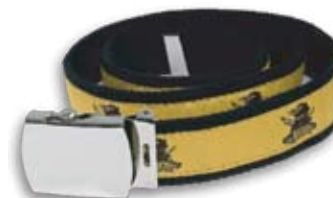
W107 – Buckle Belt with Custom Woven Fabric 1 1/4" Wide Cotton Base with Custom Woven Polyester Logo Metal Military-Style Buckle (See Sizing Chart On Reverse Side)