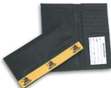
W130 – Checkbook Wallet with Custom Woven Fabric 600D Nylon with Fabric Covering 6 1/2" x 3 1/4"