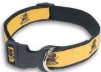
W150 – Dog Collar with Custom Woven Fabric Adjustable Buckle Release (See Sizing Chart On Reverse Side)