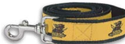
W155 – Dog Leash with Custom Woven Fabric and Metal Clip