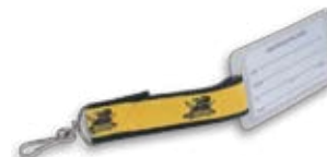
W140 – Luggage Tag with Custom Woven Fabric Soft Nylon Pouch with I.D. Card