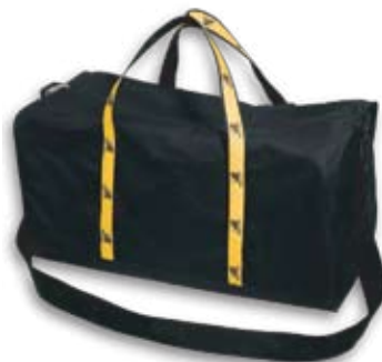
W115 – Duffle Bag with Custom Woven Fabric 600D Nylon Fabric 20 x 10 x 10 Straps are 1.125" Nylon Webbing with Custom Woven Polyester Logo