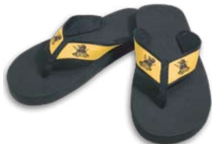
W105 – Flip Flops Flip Flops with Custom Woven Straps Custom Woven Fabric Straps Assembled Through Bottom Classic 15mm Single-Layer Sole (See Sizing Chart On Reverse Side)