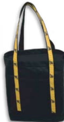
W120 – Tote Bag with Custom Woven Fabric 600D Nylon Fabric 18 x 12 x 6 Straps are 1.125" Nylon Webbing with Custom Woven Polyester Logo