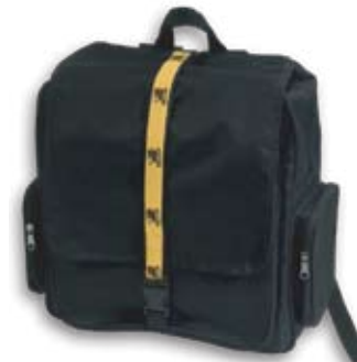
W110 – Backpack with Custom Woven Fabric 600D Nylon Fabric 15 x 12 x 5 Strap is 1.125" Nylon Webbing with Custom Woven Polyester Logo