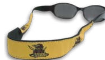
W125 – Sunglass Holder with Custom Woven Fabric “Croakie” Style 1" Elastic Nylon Webbing with Custom Woven Polyester Logo